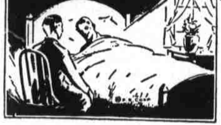
Allow no visitors. Measles is the most contagious of diseases.