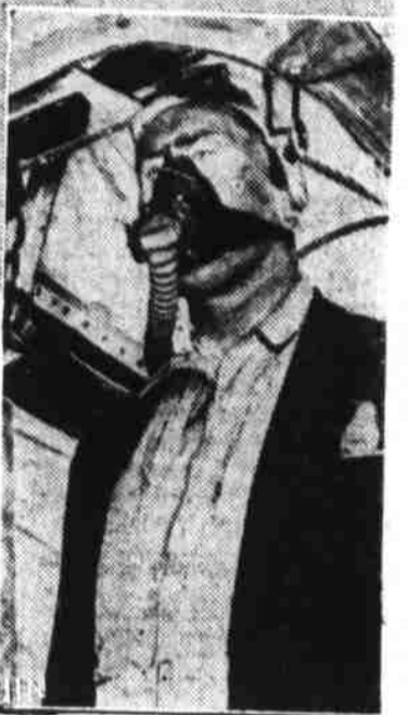
Capt. George Eyston with mask

When this photo was taken of the giant racing car Thunderbolt, piloted by Capt. George E. T. Eyston, British speed ace, the huge juggernaut was traveling at a clip of 347 miles per hour over the salt flats at Bonneville, Utah. Eyston is shown wearing the fresh air mask he donned for the trial which was not accepted as an official record because the timing device failed to register properly.