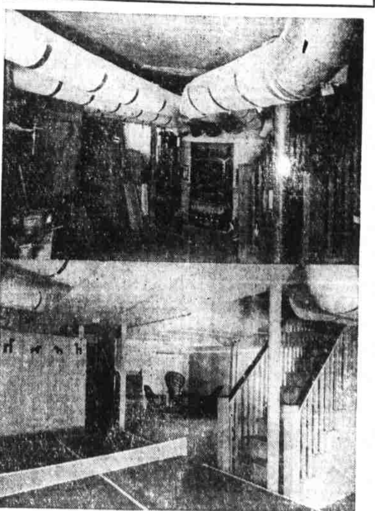
The basement shown in the above "Before and After" pictures was modernized and given added functional use by replacing the old type furnace with a smaller unit. The space salvaged by this improvement was then transformed into a recreation room by introducing adequate lighting and ventilation. Walls, ceiling, and stairs were repainted to complete the improvement.