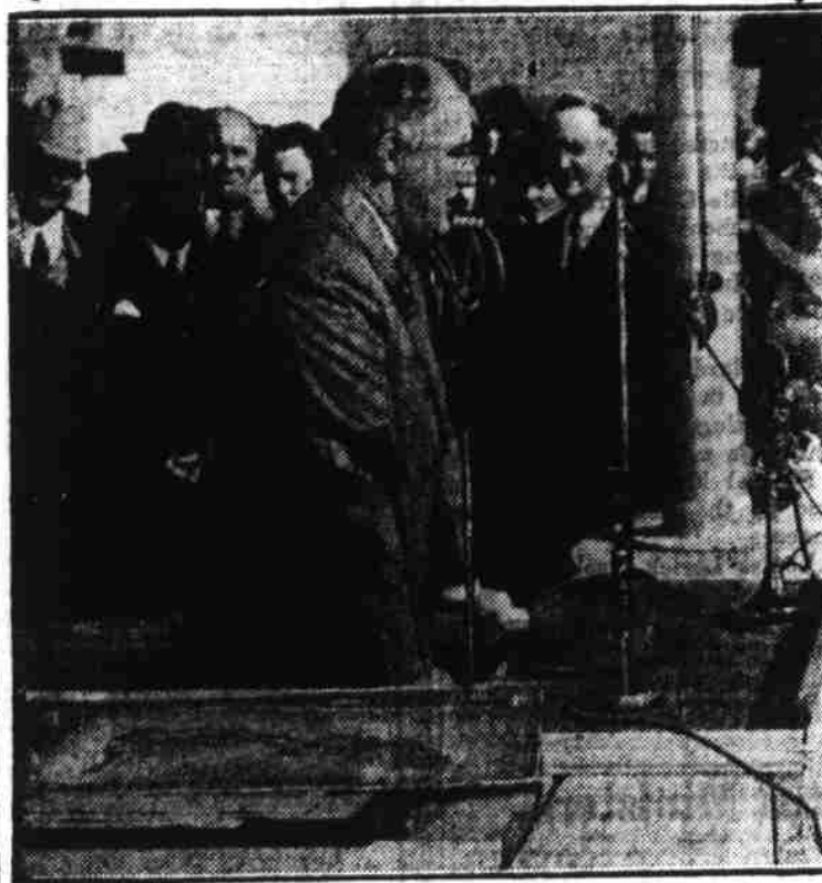
President Roosevelt speaking en route to Warm Springs, Ga., for a Thanksgiving visit. President Roosevelt stops at the Chickamauga dam at Chattanooga, Tenn., to inspect the structure. It was the president's first view of the dam, a unit of the Tennessee Valley Authority.