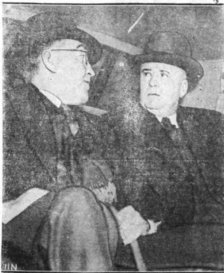
Speaker William B. Bankhead and Representative Sam Rayburn, Democratic leaders in the house, are pictured in earnest conversation in the capital after visiting the House where the president and his aides mapped plans for the new congress.