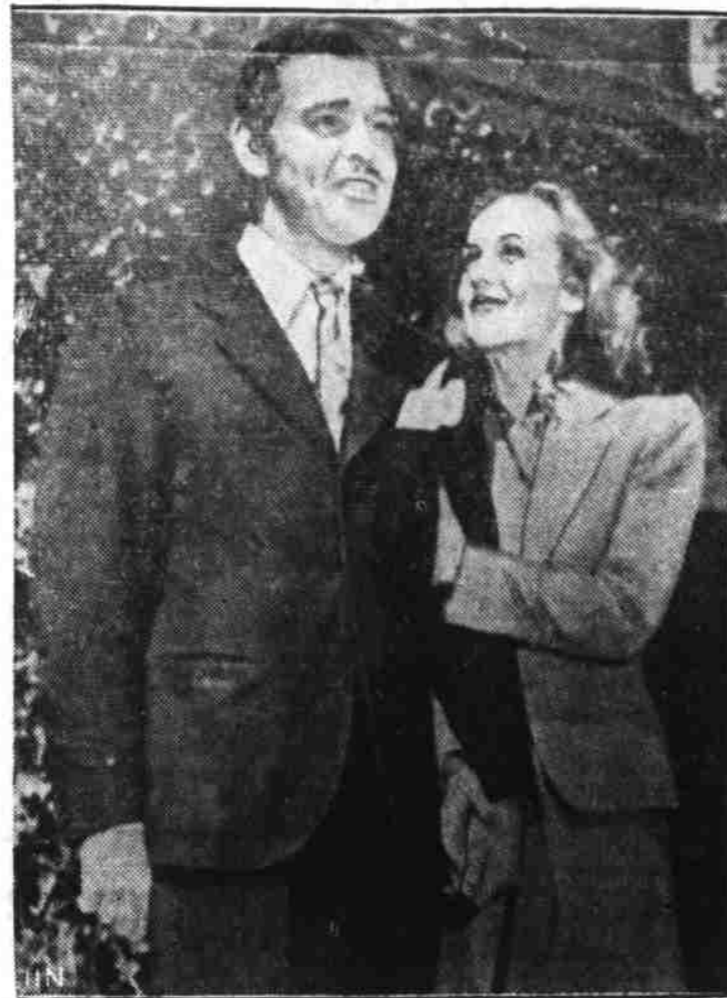
Mr. and Mrs. Clark Gable

Smiling happily are Clark Gable and Carole Lombard Gable, motion picture stars, on their return home to Bel Air, Los Angeles, Cal., ending their one-day honeymoon following their surprise marriage in Kingman, Ariz.