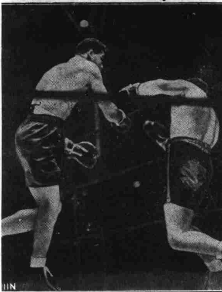
Joe Louis, world's heavyweight champion, is seen, left, as he delivers the knockout punch to Bob Pastor, challenger, in the 11th round of their scheduled 20-round title bout in Detroit, Mich. Pastor can be seen reeling against the ropes as he starts to fall. Joe had knocked Pastor down five times previously, in the first two rounds of the battle.