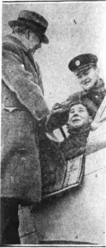
Sir Kingsley Wood, British air minister, stands on the wing of a warplane to chat with one of the Polish fliers now serving in Britain's Royal Air Force. The aviators wear the R.A.F. uniform but have the word "Poland" embroidered on shoulder.