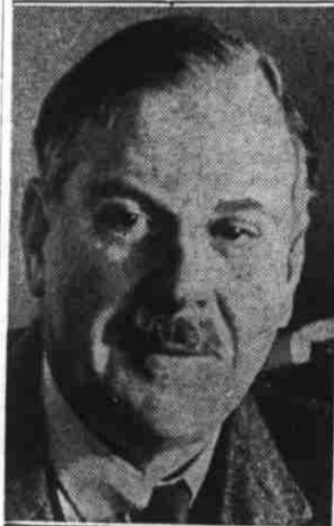
The Earl of Elgin is most prominently mentioned by British press as possible successor to Lord Tweedsmuir as Canada's Governor General.

Cranberry Tarts—Ingredients: three cups cranberries, two tablespoons butter, two tablespoons flour, two cups sugar, one-fourth teaspoon salt, one-half teaspoon cinnamon, one-fourth teaspoon ground cloves, two eggs, one tablespoon grated lemon peel. Cook cranberries about ten minutes in boiling water. Put through sieve, then add butter. Sift dry ingredients together and stir into cranberries. Add grated peel to beaten egg yolks and add to mixture. Fold in stiffly-beaten egg whites. Line individual tart pans with pie pastry. Pour cranberry mixture into tins. Cut any desired design from pastry and arrange in pattern on top of each tart. Bake in hot oven.