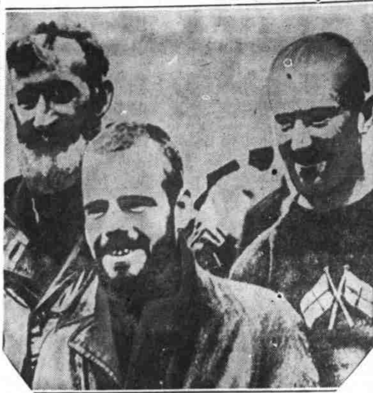
Norway is complaining and Germany is indignant about British capture of the German prison ship Altmark in Norwegian waters, but these British sailors who were rescued are mighty happy about it. Three of the 326 seamen freed, they are pictured as they were brought to Leith, Scotland, by the destroyer Cossack.