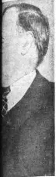
ROBERT TAFT, of ...