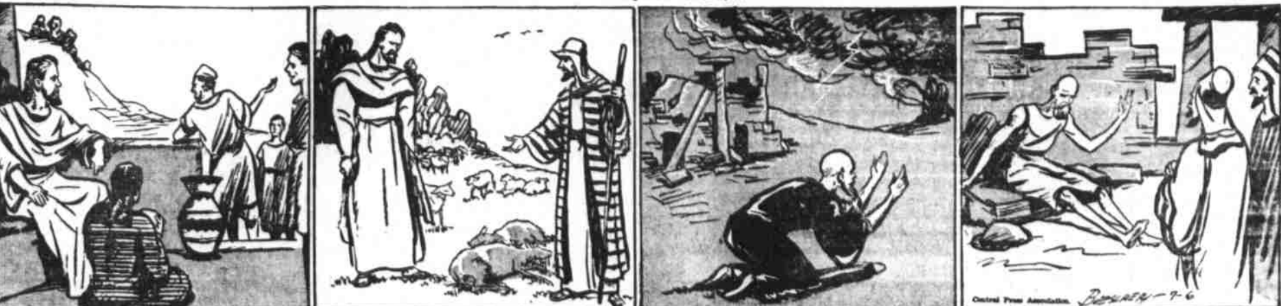
Job was a perfect and upright man, who feared God and eschewed evil; he had seven sons and three daughters and much riches in sheep, camels, oxen and she asses.