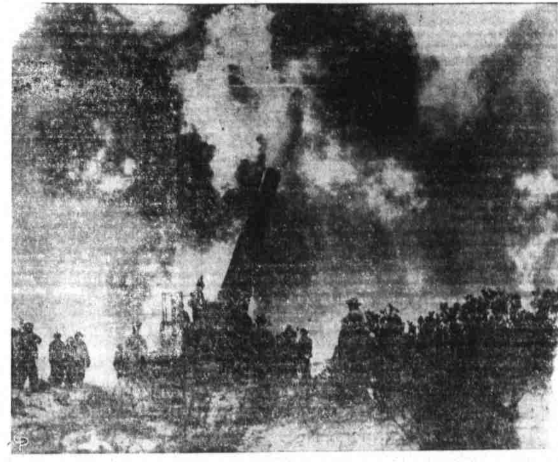
One of the giant 16-inch guns of the Coast Artillery at Fort Tilden, Rockaway, N. Y., "speaks" for the first time in five years as America brushes up on its defenses. The gun was aimed at a theoretical enemy 15 miles at sea, and scored several hits on the 18-foot-square target. Each shell costs $3,000. The test indicated any invader would receive a warm welcome.