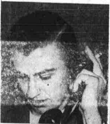
Franklin D. Roosevelt, Jr., third son of the President, is pictured hard at work at Democratic campaign headquarters in New York. Working for re-election of his father, he is directing activities among college students. Young Roosevelt will soon become a law clerk.