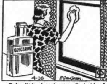
4-16 Rub a little glycerine over the inside of your windows next time you wash them. This will prevent steam from forming on them.