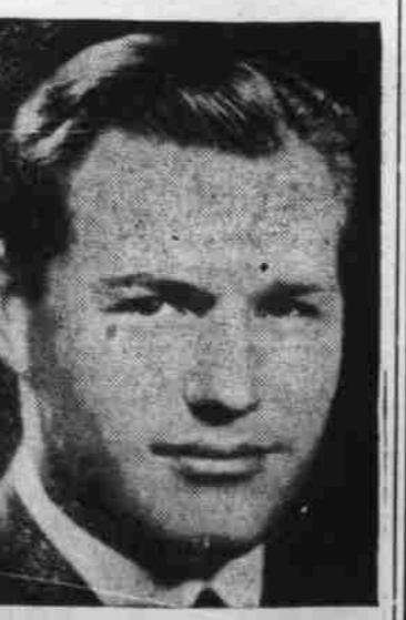
Nelson A. Rockefeller, of New York, son of the philanthropist oil baron, has been appointed by President Roosevelt to fill the newly created position of co-ordinator of commercial and cultural relations among the American republics. He serves as a $1-a-year man.