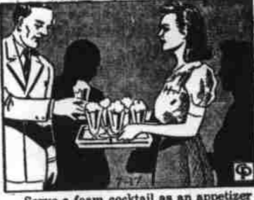
Serve a foam cocktail as an appetizer before dinner. Beat an egg white, add one tablespoon sugar, beat again. Add a can of chilled grapefruit juice, shake a little, pour into small glasses and sprinkle with a little ground nutmeg on top.