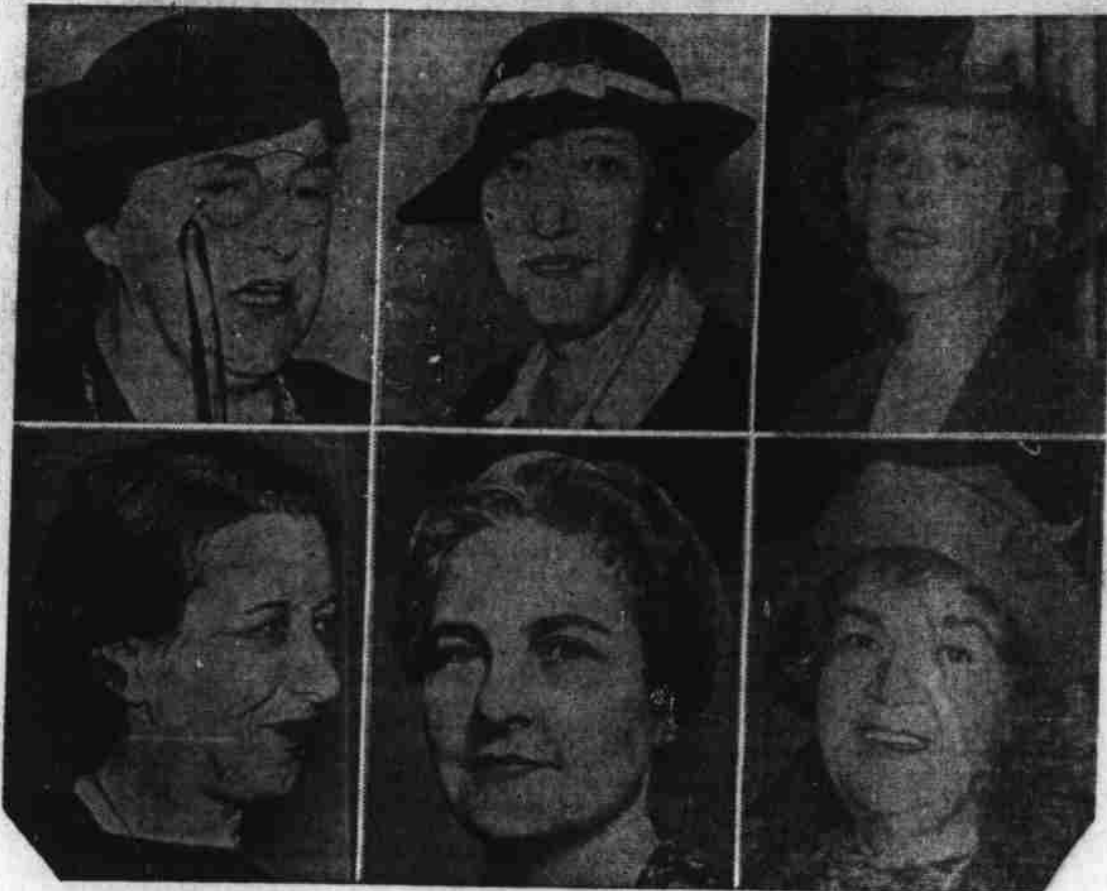
Here are six of the eight women who will serve in the next session of Congress. Top (left to right) are Mary T. Norton, re-elected New Jersey Democrat; Caroline O'Day, re-elected New York Democrat; and Jeannette Rankin, Montana Republican and first woman ever elected to Congress, returning after an absence of 22 years. Lower, Jessie Sumner, re-elected Illinois Republican; Mrs. Frances P. Bolton, Ohio Republican; and Edith Nourse Rogers, re-elected Massachusetts Republican.