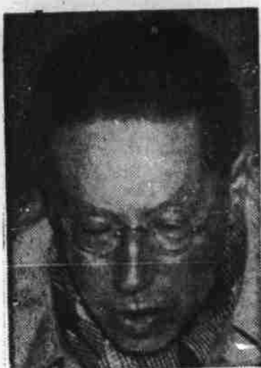
Lion Feuchtwanger, famed German-Jewish author whose books were burned by the Nazis and who carried on his war against Hitler in France, is shown in New York after a sensational escape from a French concentration camp. He was smuggled out by an American friend and put aboard an American ship at Lisbon.