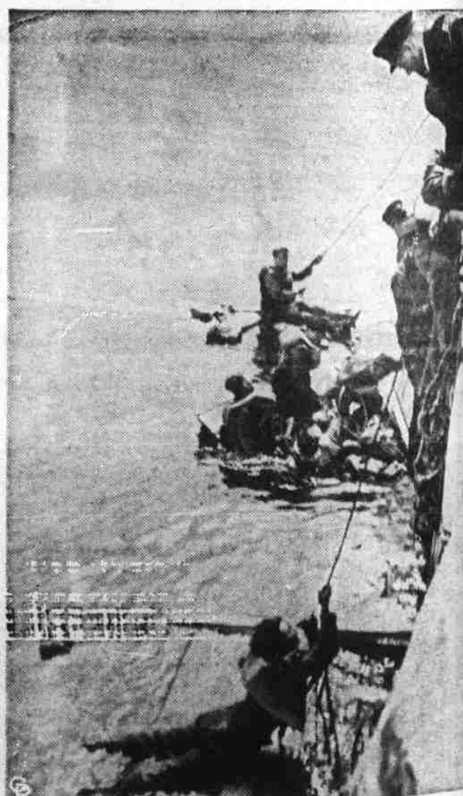
This dramatic photo, released by the Royal Canadian Navy, shows the rescue on the high seas of the survivors of a torpedoed merchant ship. The rescue was made by a Canadian destroyer. Note man in foreground obviously too weak to climb the rope thrown to him, holding on to dear life.