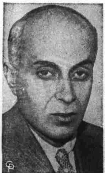
Pandit Jawaharlal Nehru, former president of the Indian Congress party, was arrested by British authorities near Allahabad after a meeting with Mohandas K. Gandhi. He was one of two men chosen by Gandhi to make anti-war speeches as part of the plan of limited civil disobedience.