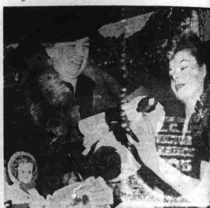
Mrs. Franklin D. Roosevelt sets an example to the women of the nation by doing her Christmas shopping early. She is pictured in a Fifth Avenue shop, in New York, selecting toys for her grandchildren.