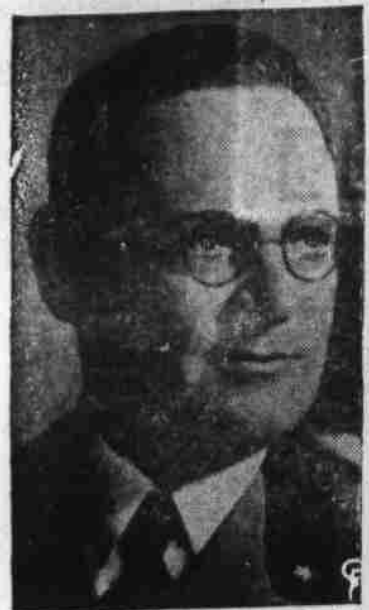
Rome spokesmen announced that General Ubaldo Soddu, secretary for war in the Italian cabinet, has been sent to Albania to direct the drive against Greece. General Soddu, 57, is a veteran of all Italy's wars since 1900.