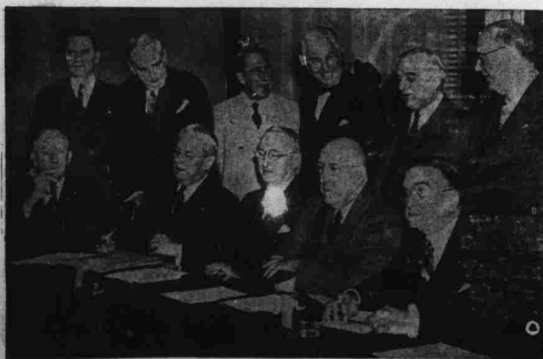
The Senate foreign relations committee is pictured as it convened in Washington to debate the possibility of further aid to Britain. Seated (left to right) are Senators Pat Harrison of Mississippi, Hiram W. Johnson of California, Walter F. George of Georgia, chairman; Elbert D. Thomas of Utah and Frederick Van Nuys of Indiana. Standing, are Senators Gerald P. Nye of North Dakota, Arthur H. Vandenberg of Michigan, Theodore F. Green of Rhode Island, Guy M. Gillette of Iowa, Joseph F. Guffey of Pennsylvania and Bennett Champ Clark of Missouri.