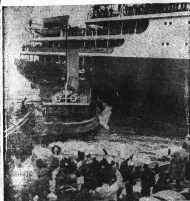
Pulling out from her New York pier is the United States liner Washington, Orient-bound to bring home Americans from the Far East. On board can be seen some of the members of the Second Division Naval Reserve from Baltimore, 139 men and six officers, who will take up active duty in the Panama Canal Zone.