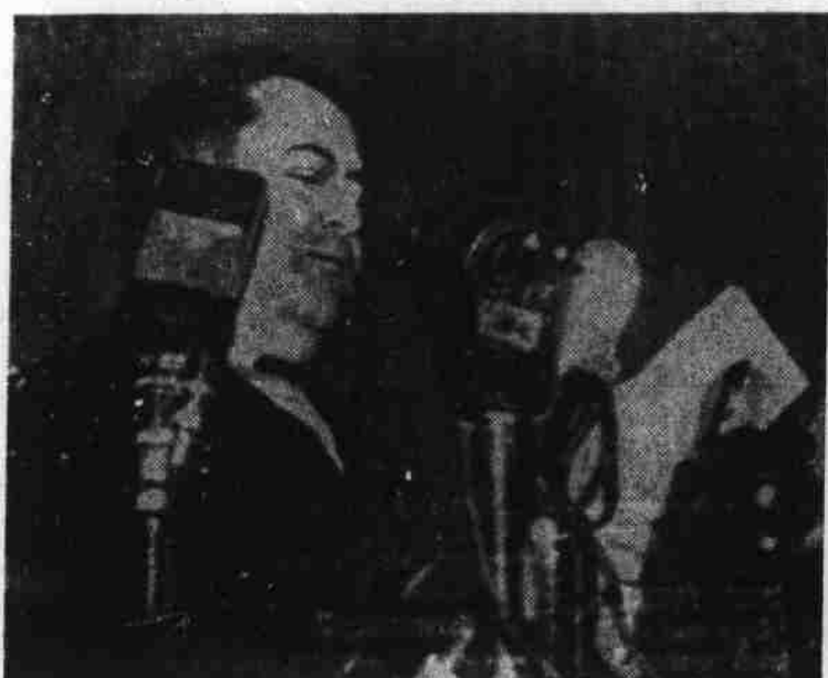
General Manuel Avila Camacho is shown making his inaugural address after taking the oath of office as President of Mexico in Mexico City. He placed his republic beside the United States and all other American nations in the common cause of hemisphere defense.