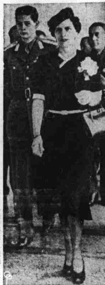
Shortly after this picture was taken of Queen Mother Helen and King Michael of Rumania, the streets of Bucharest ran red with blood. The Queen Mother and her son are shown reviewing a parade. A dispatch brands as false reports Michael is preparing to quit in the face of the terror provoked by the Iron Guardists. Queen Helen has left Rumania.