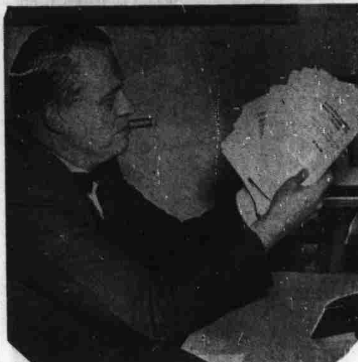
Representative Martin Dies, of Texas, chairman of the House committee investigating un-American activities, displays "exhibits" in his sensational "white paper" accusing Axis agents of attempting to sabotage national defense industries. He is shown in his Washington office.