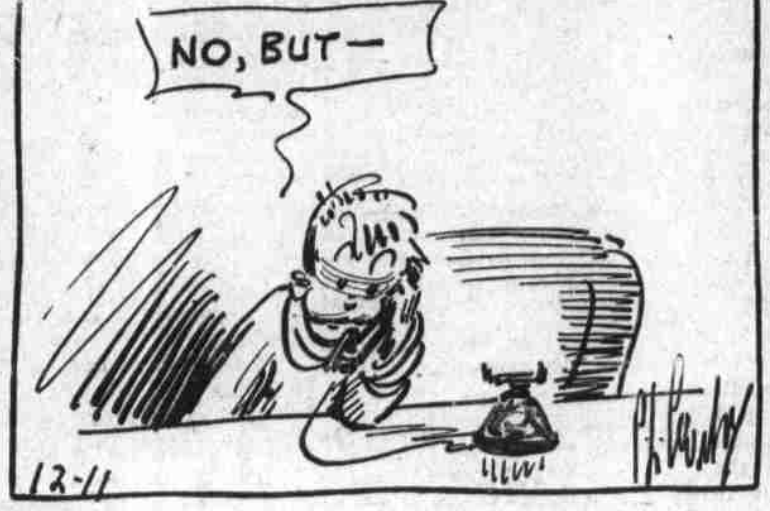
By Perry L. -WE USED TO OWN A CANARY AN' ONE DAY Copr. Percy L. Crosby, World rights rese 1940 King Features Syndicate, Inc.