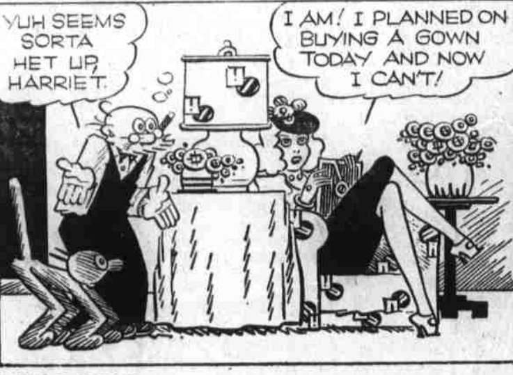
JUH SEEMS SORTA