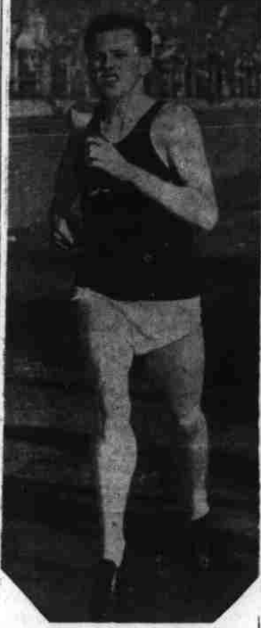
Fred Wilt flashes across the finish line at the Penn Relay Carnival, Philadelphia, to break a Relay record that stood for 20 years.