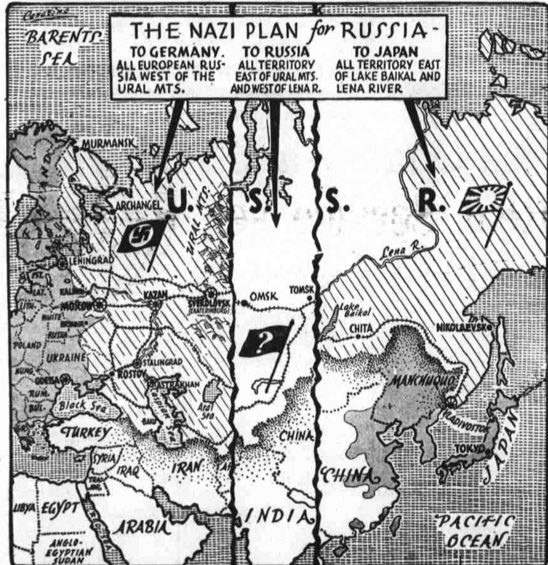
This map shows how the Nazis plan to cut up the Russian Bear (with the aid of Japan). Germany has cut a big slice in the West for herself; a big slice in the East goes to Nippon, and what's left would be a "free" Russia under orders from Berlin. Even the name of Russia would disappear from the map. This plan was elaborated in detail by Alfred Rosenberg and his expert staff.