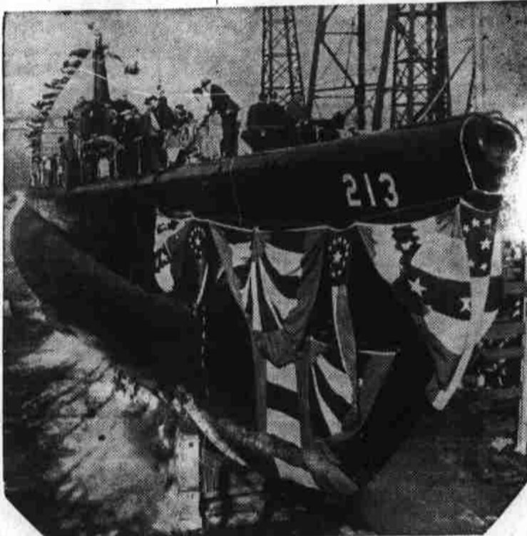
America's fast-growing two-ocean navy, greatest in the history of the world, is augmented by another warship as the submarine Greenglass goes down the ways at New London, Conn.