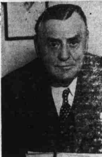
Oscar, famed chef of the Waldorf Astoria in New York, is shown on the eve of his 75th birthday, which he is celebrating with a gala charity ball for the benefit of the U. S. Navy. Oscar has been with the noted hotel for 48 years, ten of which were with the new Waldorf.