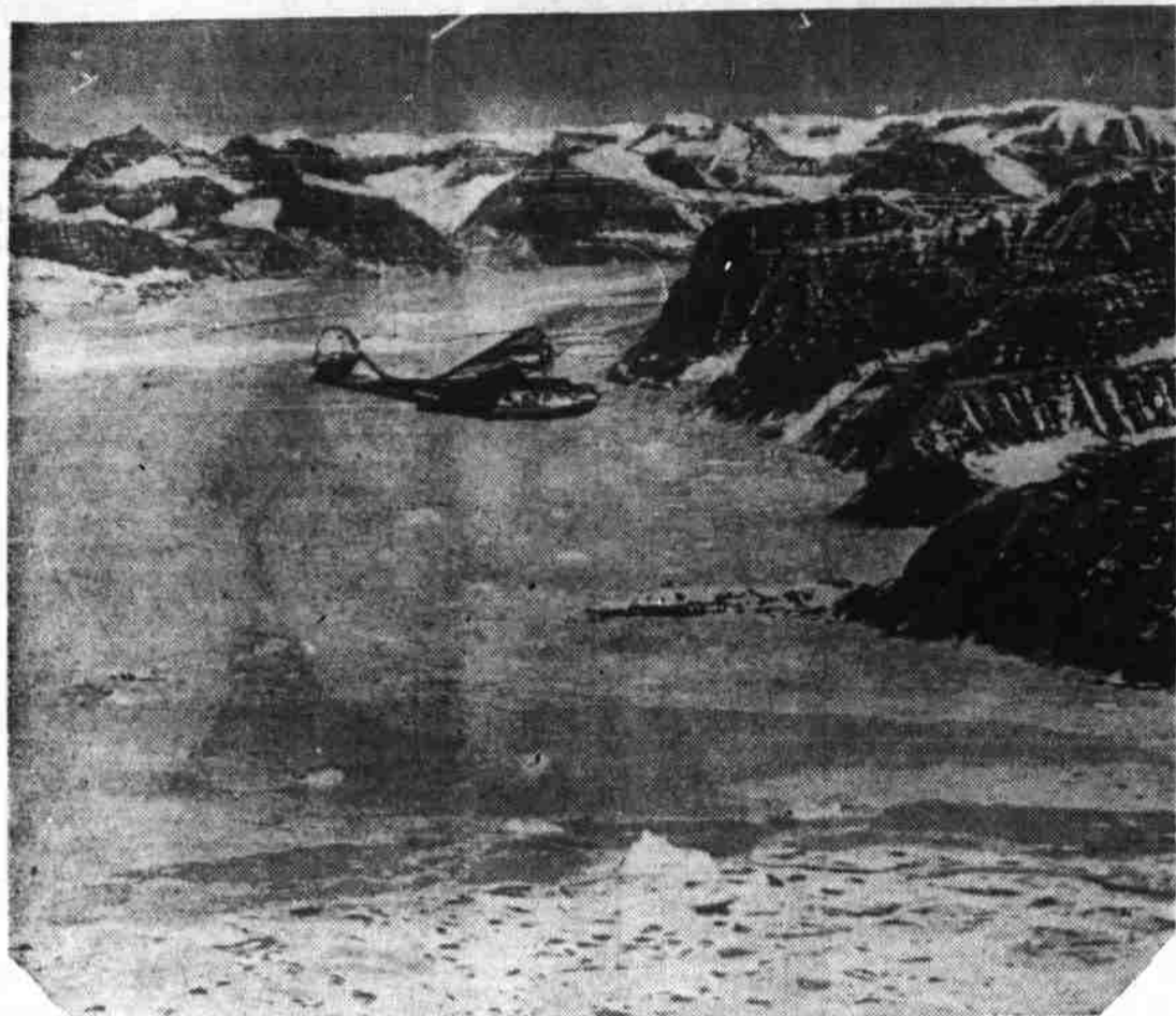
In solitary splendor a U. S. Navy PBY air patrol plane wings its way on a flight over our far northern outpost in Greenland. Far below is nothing but icy wastes as winter begins slowly to close in.