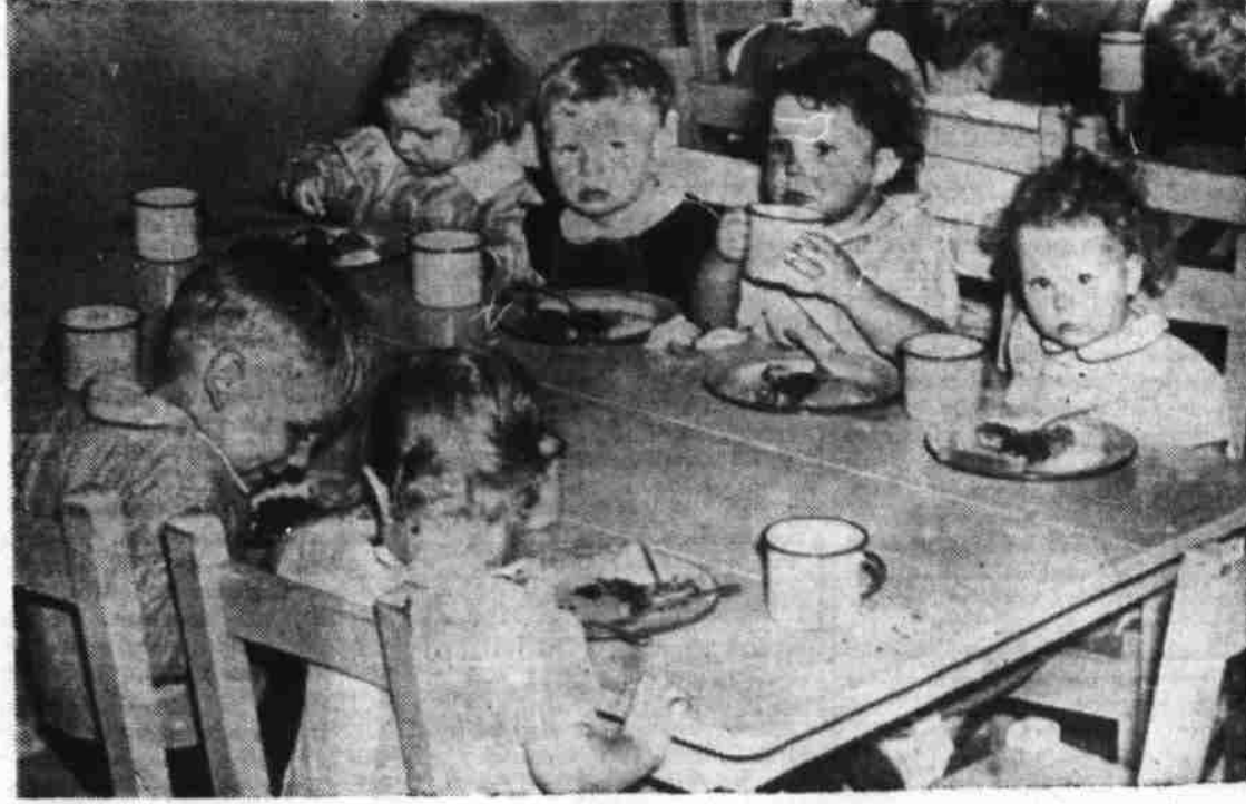
It took a war to bring home the contrast between what happens to small children in North Carolina and what happens to tiny tots in Nazi occupied Europe. Published pictures show emaciated and starved children there...