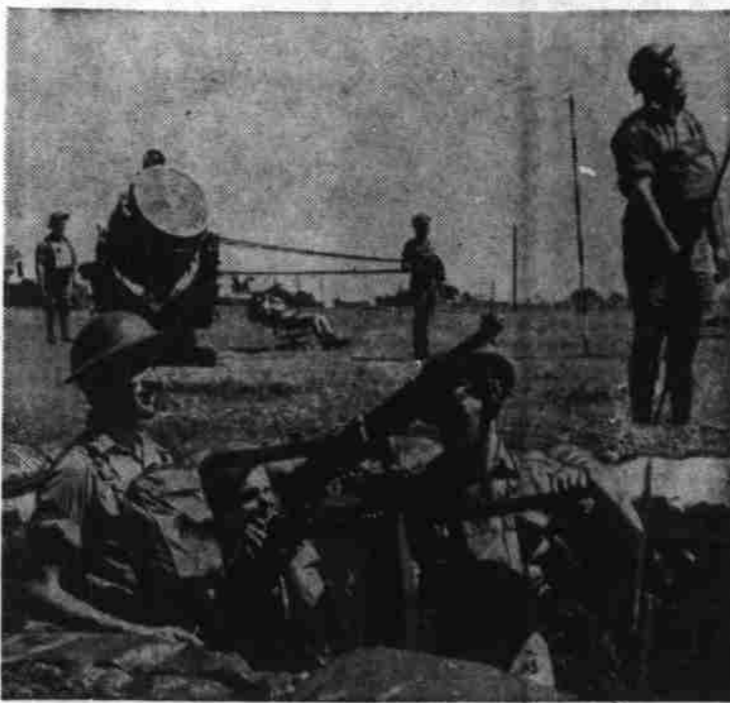
With the Japs concentrated on New Guinea bases, only 400 miles from the Australian mainland, the continent "down under" is making feverish preparations for the coming struggle with the enemy, particular attention being given to anti-aircraft defenses. Hundreds of posts, like this one outside Melbourne, are springing up everywhere.

be purchased at the designated checking stations on the streams, must be obtained. The catch of each fisherman must be recorded at the checking station before leaving the stream. The hours for fishing will be between 6:00 a. m. (local time) and sunset. The limit is 12 legal fish. All trout under seven inches in length must be returned to the water immediately. Treble or "gang" hooks are prohibited.