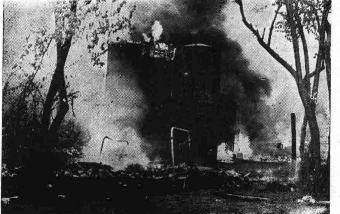
This picture was made seven hours after the explosion, and shows the flames and black smoke still pouring from the plant yard and tanks. Note the white gas flame atop the tank. In the foreground are the ruins of the house in which Mrs. Andy Caldwell and two children lost their lives. Other explosion pictures will be found on page 3.