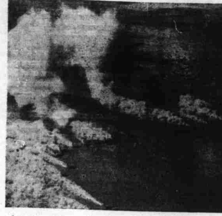
Long plumes of dust are flung into the air by the thundering propellers of a number of Boston bombers as they take off from an Egyptian desert airfield. While U. S., British and South African planes kept the enemy out of the sky, Allied desert troops and tanks poured deep inside the German lines, after blasting gaps in the barbed wire and mine fields of the El Alamein front.

ration book, (or in the East, when of all tires now on the wheels he registers the serial number of enger cars and trucks. The his tires), will receive a tire inor cylian cars are wearing spection record. This is the 'B' at a rate eight times greater part of the tire record and applithey are being replaced. If cation for basic mileage ration nte continues, by far the form. It is to be detached and number of cars will be off presented to the applicant.