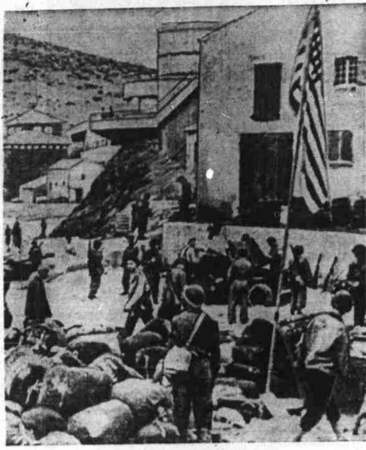
American troops stand among their duffle bags and supplies after planting the Stars and Stripes on Algerian soil at Oran in North Africa. This cablephoto obtained from a British newsreel, is one of the first taken after U. S. troops had stolen a march on the Axis and invaded strategic Algeria and French Morocco.