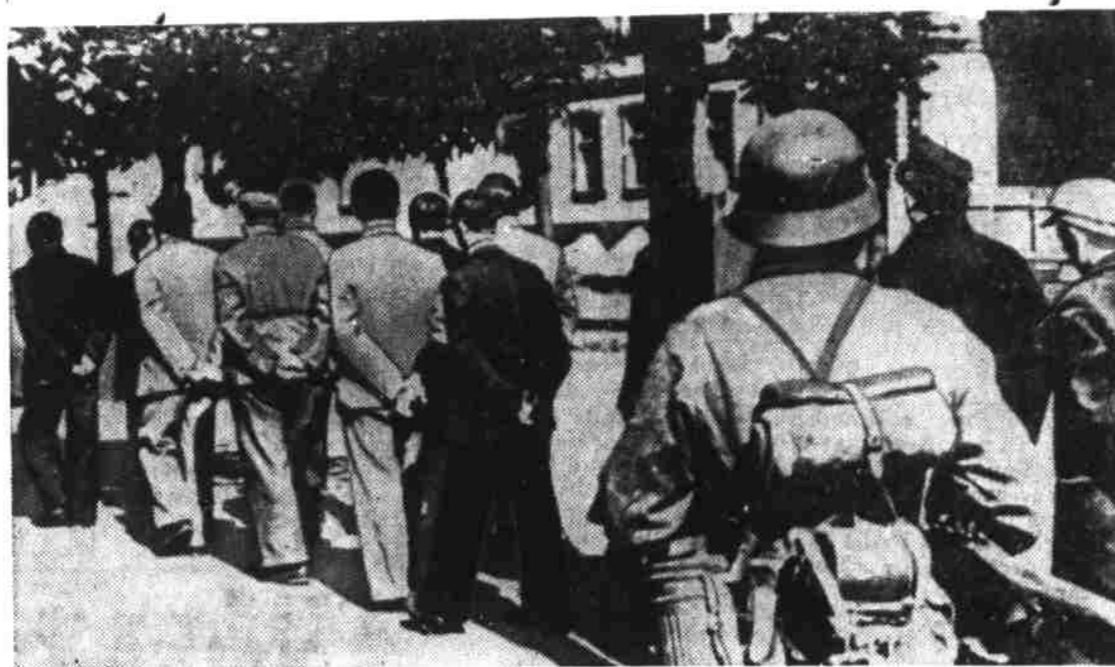
German soldiers herd before them a number of men from an unknown town in Poland. It matters little whether they are gentile or Jew. They are on their way to the ghetto at Warsaw to fill vacant quarters left by the Nazis systematic extermination of Jews. The fate that awaits these new inhabitants is known only to the Nazis. The photo, received in London through a neutral source, was passed by the censors.