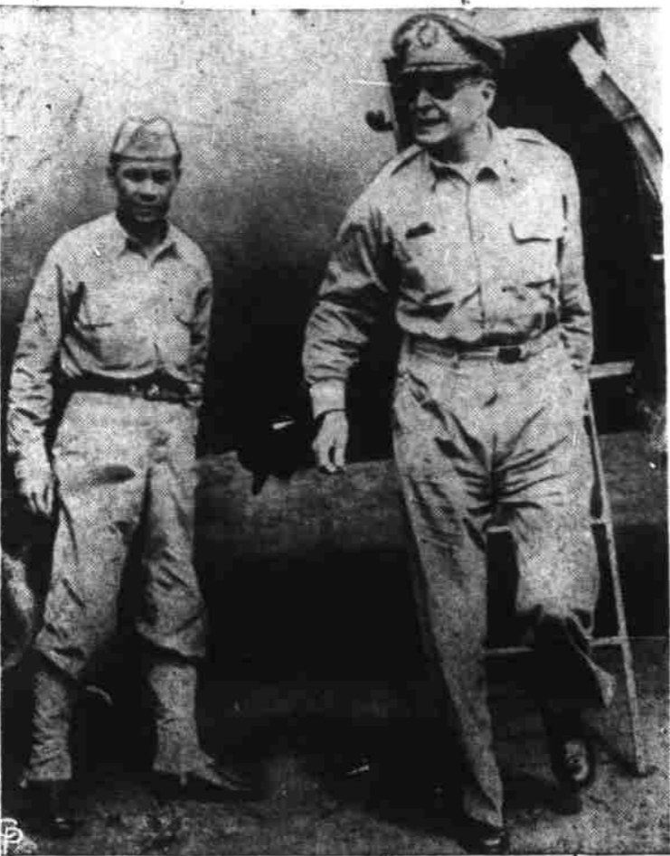
ARMED WITH HIS TRUSTY PIPE, General Douglas MacArthur, commander-in-chief of South Pacific operations, steps from his plane somewhere in New Guinea. It was about this time that Muba was being taken by his advancing Yank forces.