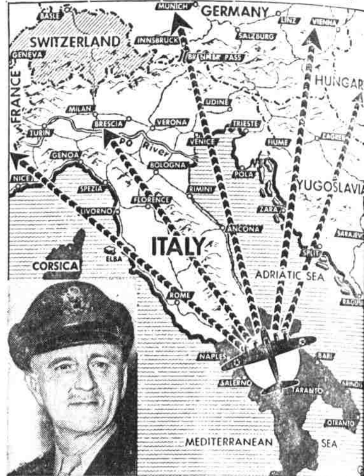
A MAJOR AIR OFFENSIVE against many Nazi targets, heretofore considered invulnerable due to distance, may be expected following execution of a new U. S. Fifteenth Air Force with Lt. Gen. Carl A. Spaatz in command of the Mediterranean area. In combining the Twelfth and Fifteenth Air Forces, bombing drives will cover a wide range of occupied and unoccupied areas as well as south Germany and Austria. Map shows captured and base area in Italy which becomes a new hub of activity and areas indicate the many possible zones of attack. North African bases within range to be used. Inset at left shows Gen. Spaatz. Shaded area indicates territory held by the Allies.