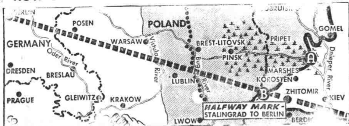
WITH LESS THAN TWO MONTHS to go to Jan. 1, the line separating the white and shaded areas on the map is the front in Poland which Russians expect to reach, and even pass, by the beginning of 1944. The line, which runs from Warsaw to the Czechoslovakian border is part of an official Russian "blueprint for 1943-44 Winter front." The map shows (A) present front, slightly over the half-way point between Stalingrad and Berlin; (B) the Russian border at the time of the German invasion and dotted line along the Bug River indicating the line to which the Germans are expected to withdraw. (International)