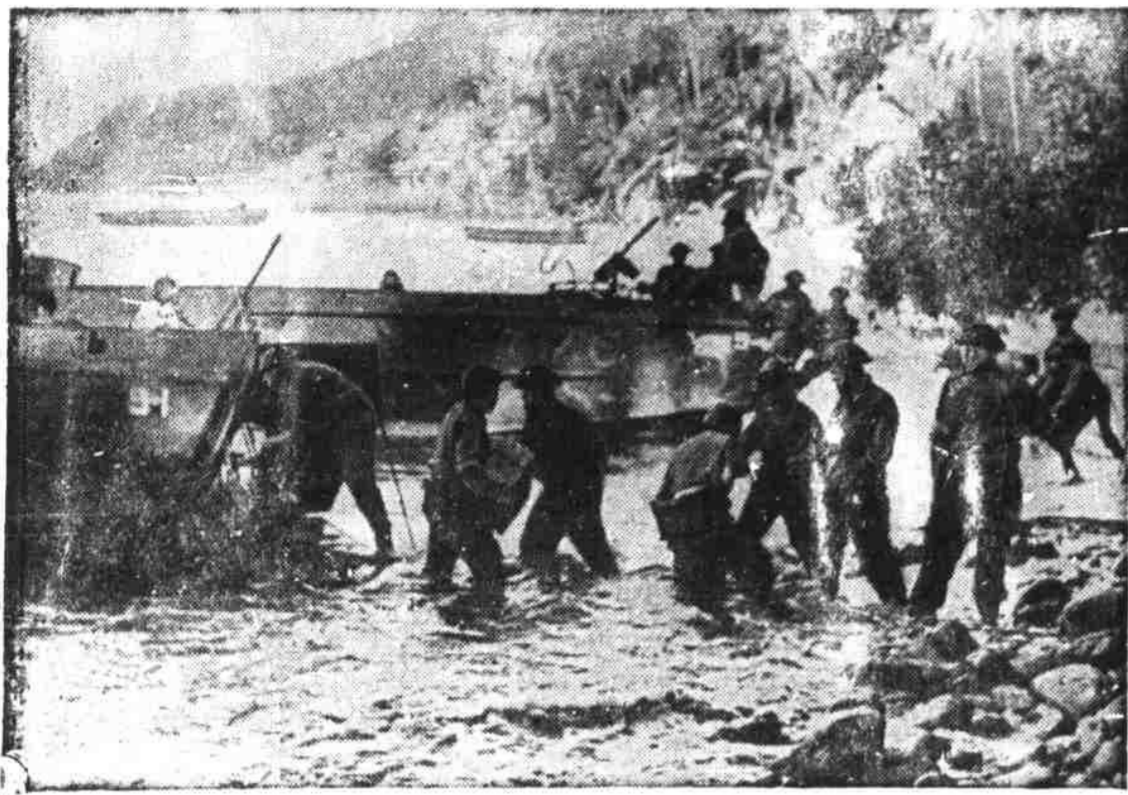
WITH BARGES beached within a few feet of the rocky shore, New Zealanders, part of the invasion force that wrested Treasury Island from the Japanese, bring ashore battle supplies. There was little resistance and the enemy was driven to the hills. The taking of this base imperils the southern approach to Bougainville Island, last important Jap base in the Solomons, on which U. S. Marines have landed.