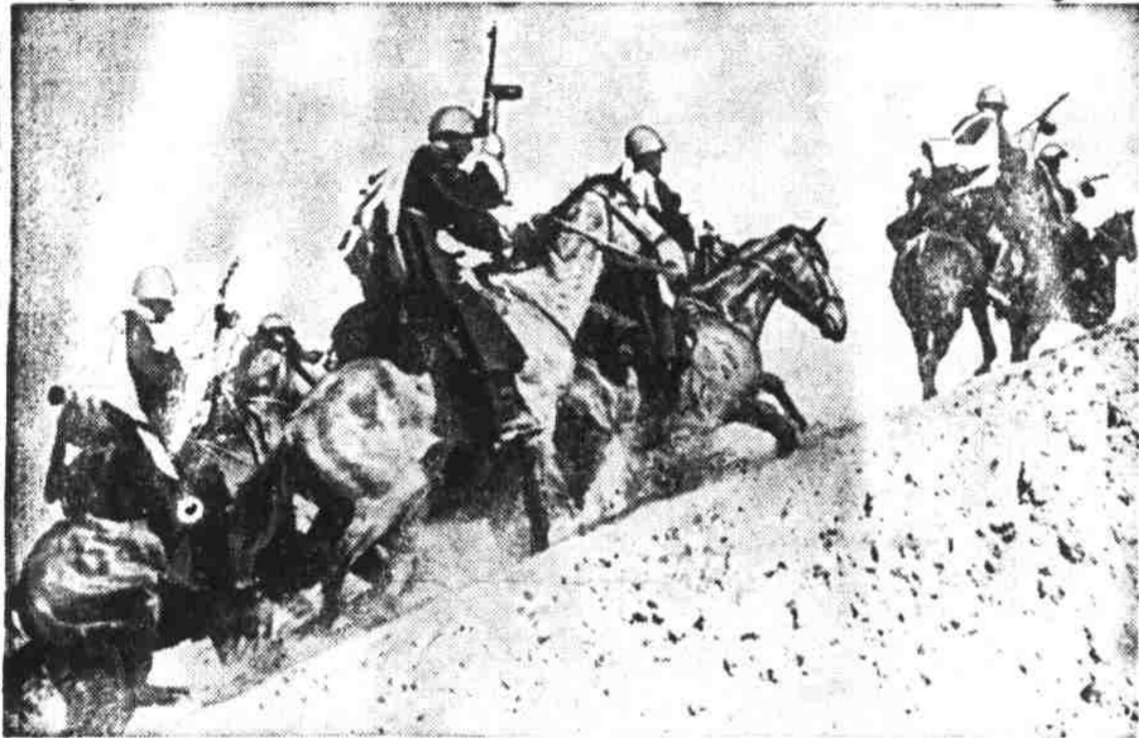
SHOWING THE EXTENT to which the Nazi retreat in southern Russia has become a rout, sabre-swinging Cossack horsemen are being used by the Russians in the final stages of the great battle of the Dnieper bend. These expert horsemen, helmeted and armed with sub-machine guns, are cutting down the trapped German units attempting to flee beyond the Dnieper estuary.