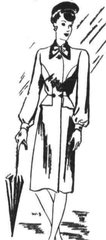
White water-proofed taffeta rain-coat.