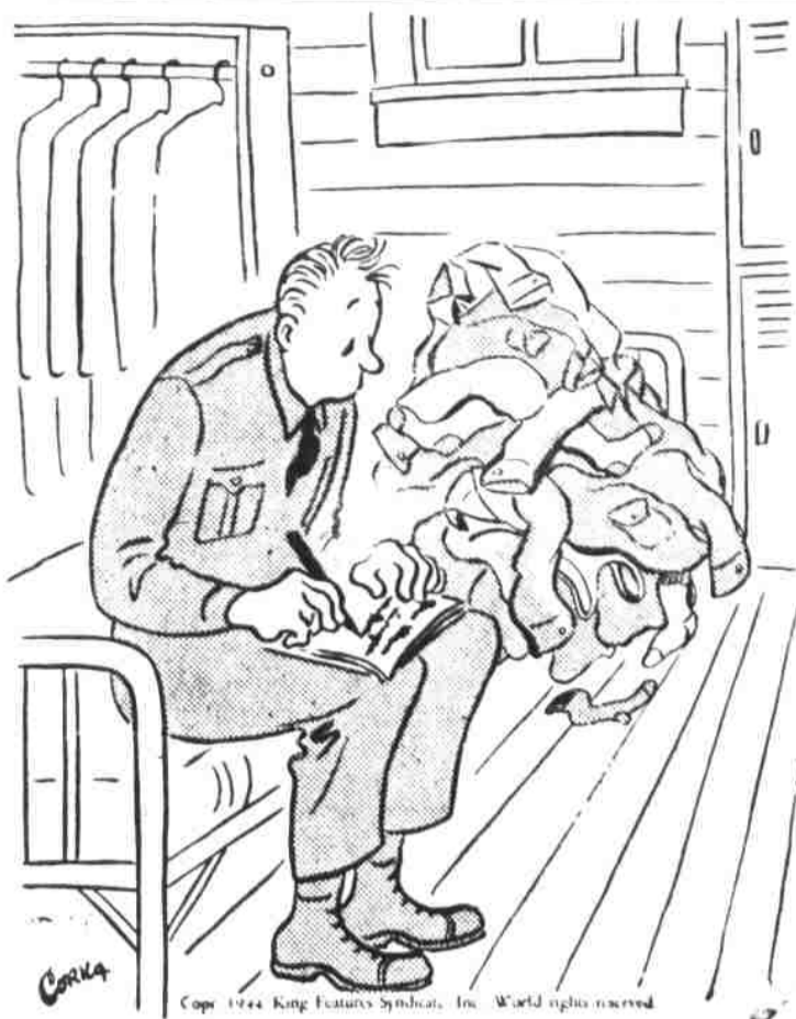
"Dear Mom—Wish you were here—"