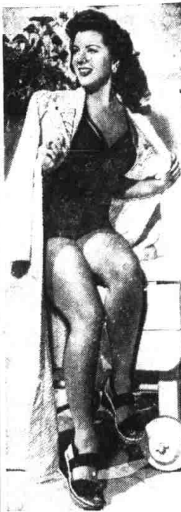
PRETTY Ann Rutherford, Hollywood film star, has issued undated invitations for a swimming party at her pool in which an effigy of Hitler will be tossed into the water and "drowned" on the day that the Nazi regime ends.