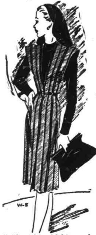
A trim and youthful jumper in striped tweed.