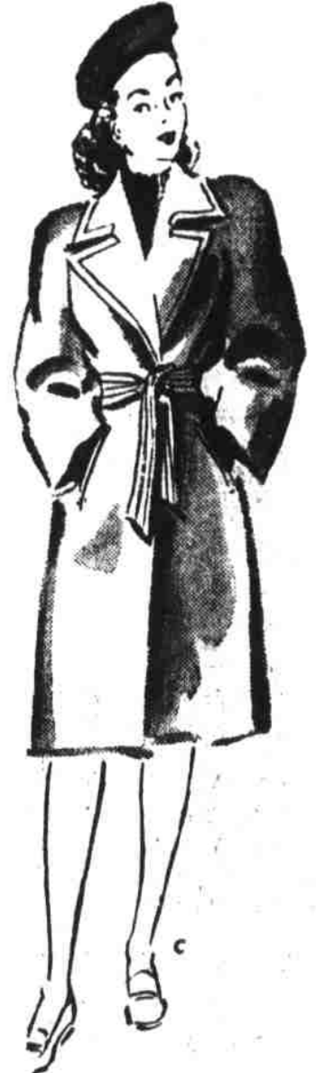
Color Clicks in Spring Coats! FROM $11.75

Starred — our dashing Hollywood wrap coat in brilliant colors—tops for smooth versatility and good looks through Spring. From a big group.