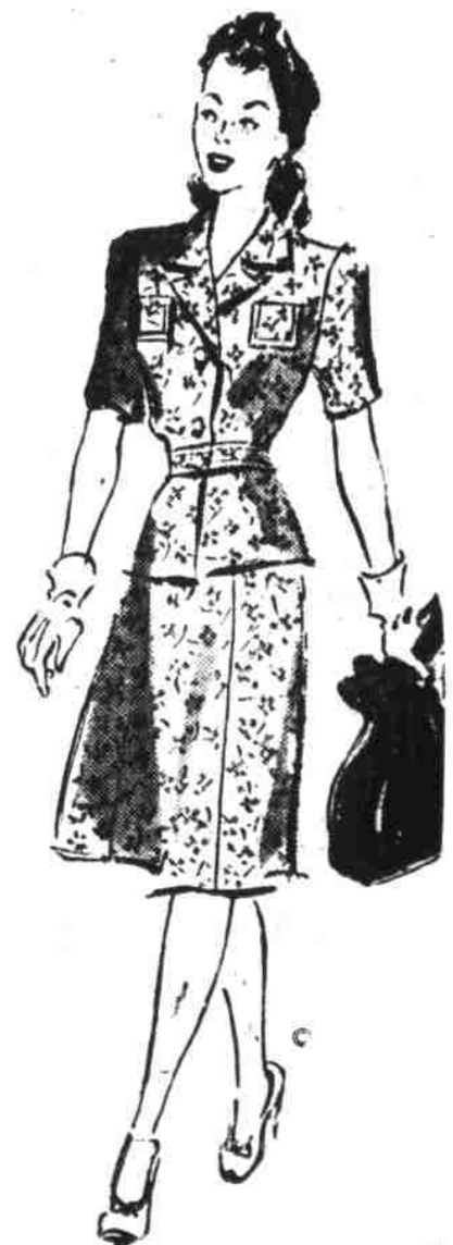
Bright Tiny Prints! FROM $7.95

Starred — our dashing Hollywood wrap coat in brilliant colors—tops for smooth versatility and good looks through Spring. From a big group.