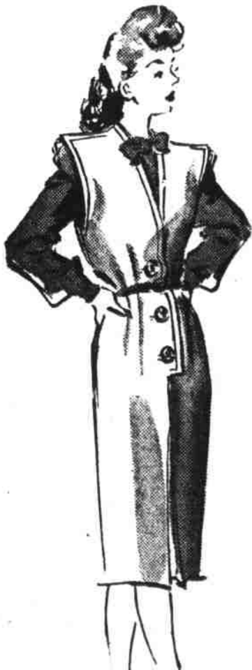
Spring Fashion News! Pastel Jumpers FROM $3.95

Brilliant tiny prints—in the news for Spring! See them here in soft suit dresses, casuals — brief-sleeved date charmers! 12-20.