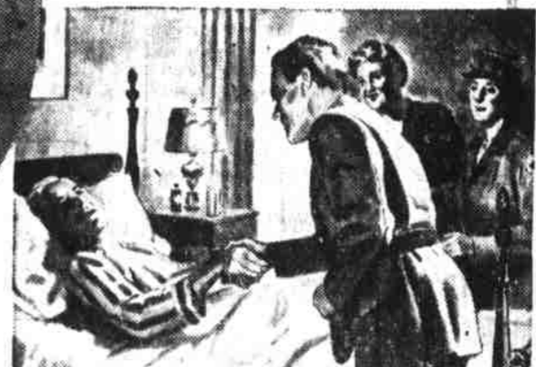
When pop got sick the Red Cross was asked to verify. And, thanks to their report, I got home!