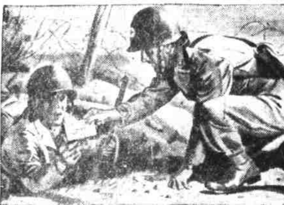
The wife's doing fine after her operation. N. Y. Red Cross Field Director brought the good news.