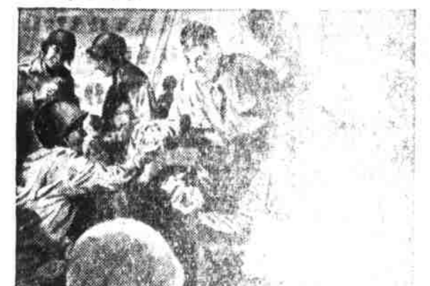
The second day out. We sure felt lucky when we got those Red Cross dirty linens.