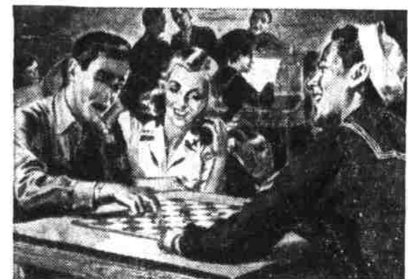
A home overseas. Just stepping inside a Red Cross club does a guy good. Home seems nearer!