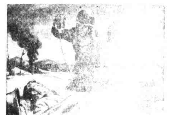
Thanks for your blood folks. We'll want you, our medical corps, and the Red Cross make!