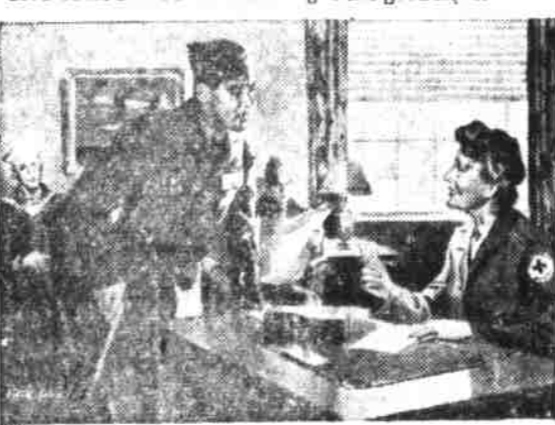
Back to civilian life. The wise veteran goes to the Red Cross! There they know the answers and are eager to help an ex-service man with his problems.