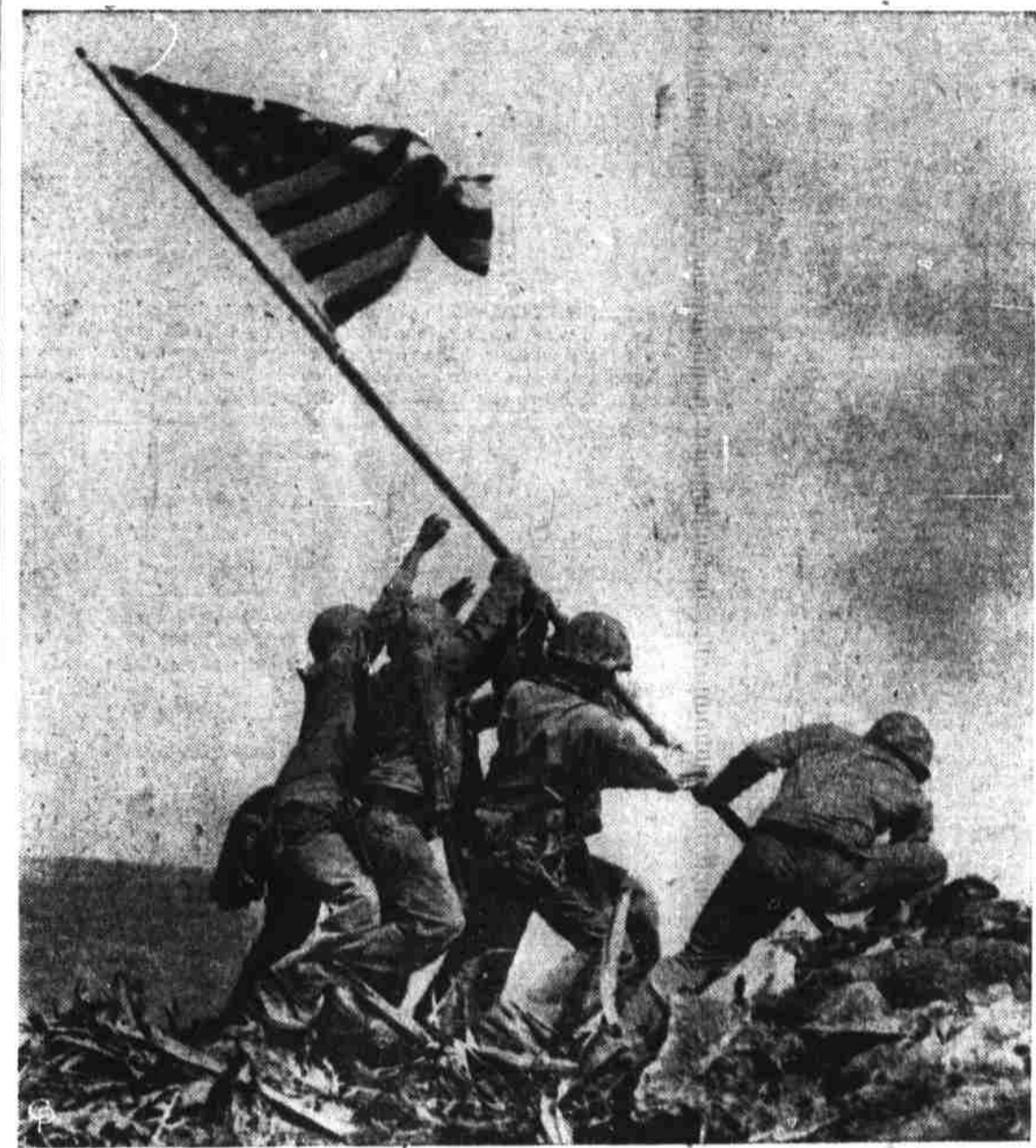
This history-making photo, radioed from Guam shows U. S. Marines of the 28th Regiment, 5th Division hoisting the Stars and Stripes on the rocky summit of Mt. Suribachi, Iwo Jima. While the marines were planting Old Glory out in the Pacific, the Yanks were crossing the Rhine and the Russians were making a powerful drive toward Berlin. The American First Army were driving through heavy German fire five miles North of the Remagen Bridge. General Patton and his Third Army were forcing close death traps upon pocketed Nazis on the bank of the Rhine.