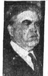
John L. Lewis