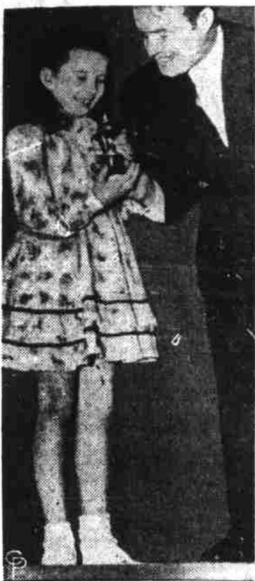
COMEDIAN Bob Hope presents to eight-year-old Margaret O'Brien an "Oscar" after she was selected as the outstanding child actress of 1944...