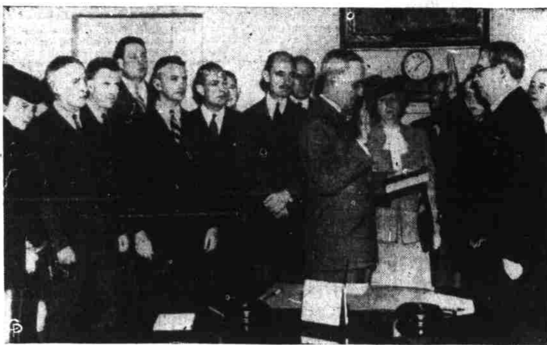
HAND ON THE BIBLE, Harry S. Truman is shown being sworn in to the office of President of the United States by Chief Justice Harlan F. Stone in the Cabinet Room of the executive offices in the White House...