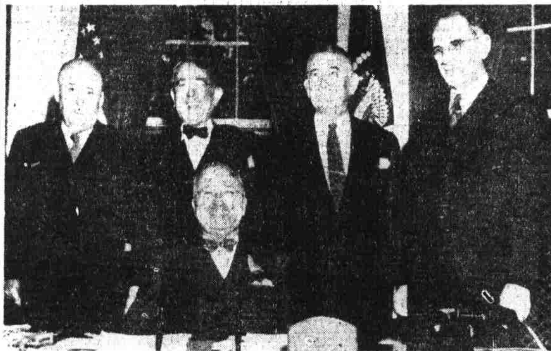
STANDING BEHIND PRESIDENT HARRY S. TRUMAN in the White House are four key legislators who paid him a visit for the first time since he became Chief Executive. They are (l. to r.): Rep. Sam Rayburn, Speaker of the House; Senator Kenneth McKellar of Tennessee, President pro-tem of the Senate; Senator Alben W. Barkley of Kentucky, Majority Leader of the Senate; and Representative John W. McCormack of Massachusetts who is the majority leader of the House of Representatives.