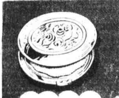
New Compacts $2.95