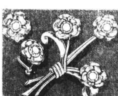
Dora and Barrietas $9.95 up