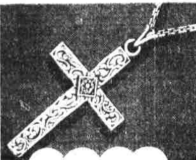
Diamond Cross $7.95