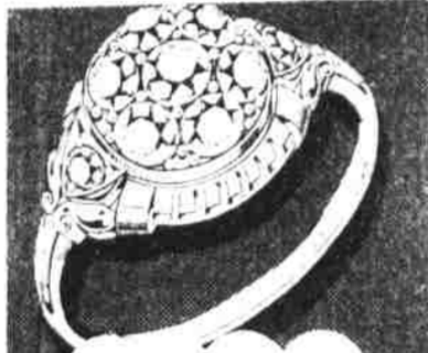
Cluster Ring $6.95 up