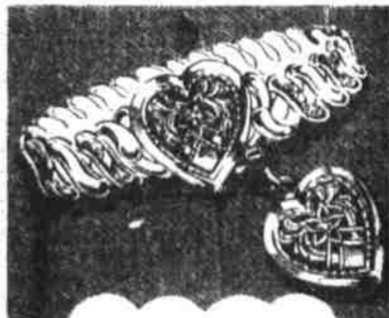
CARMEN SETS $22.50