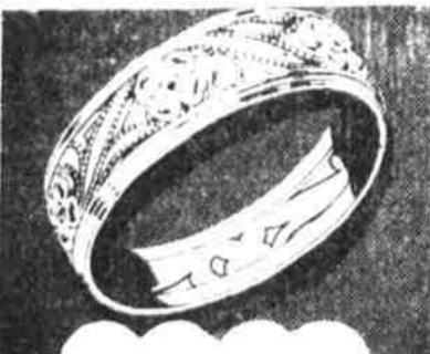
Wide Band from 7.95 up