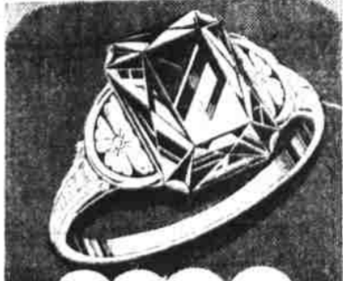
Birthstone $6.95 up