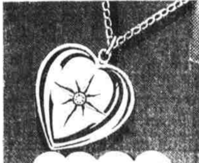
Diamond Locket $12.50