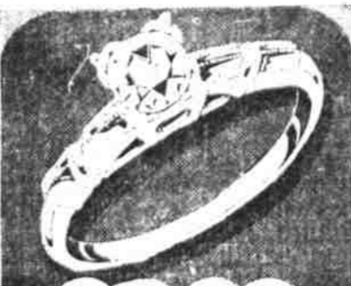
Diamond Ring $49.75