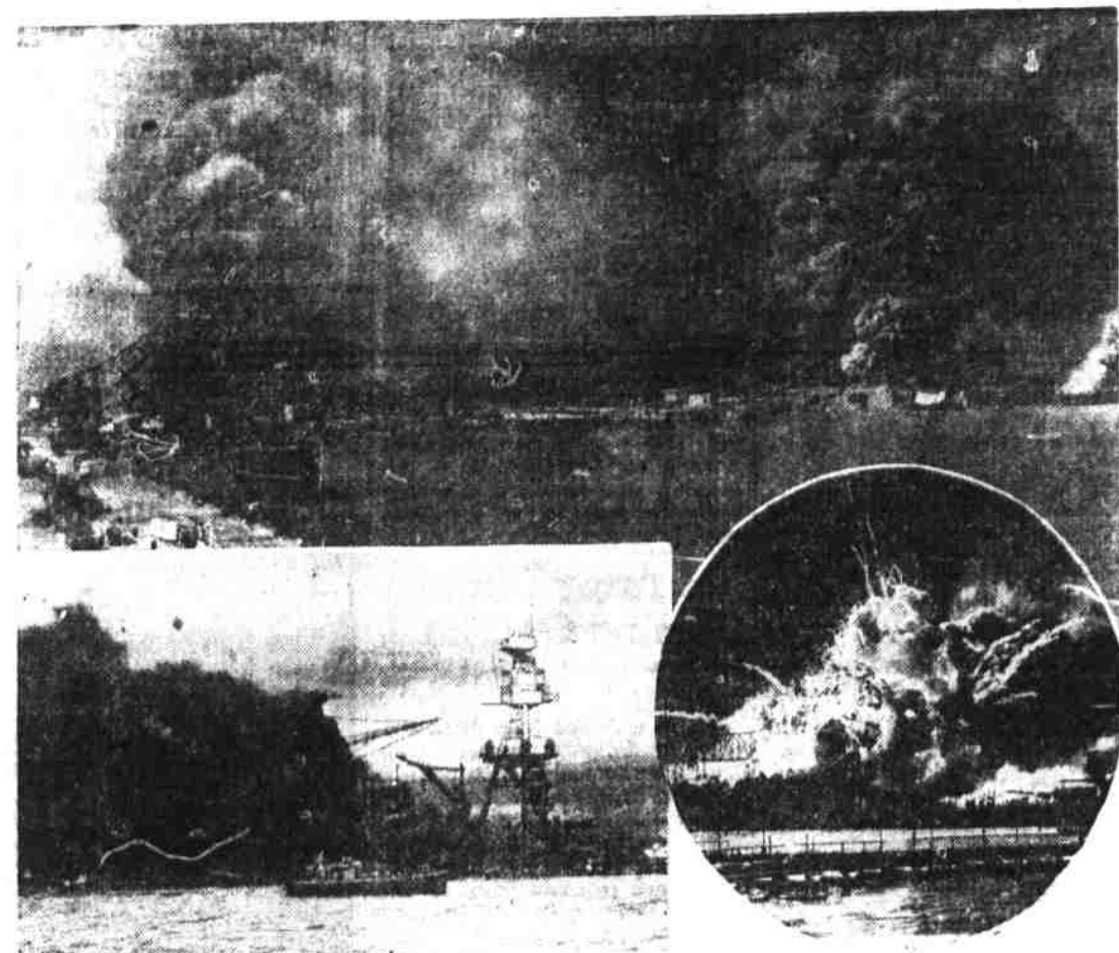
Ships in Pearl Harbor sinking, following December 7 attack (upper). A general view of the harbor is given. Lower left shows the USS Arizona on fire; at right, the explosion of the USS Shaw. This was the event that put U. S. into the war on the Axis.