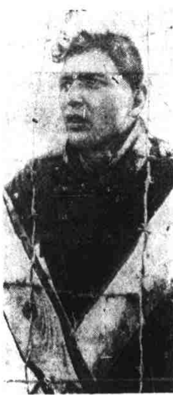
FRAMED BY THE "V" in what might be a V-for-Victory fence that pens him in, somewhere in Germany, is one of the dejected "werewolves" that were howled about as Germany's last-ditch defenders—until our armies changed their minds.