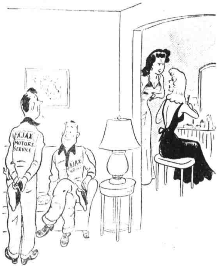
532. "These books are in the hand date with are..."