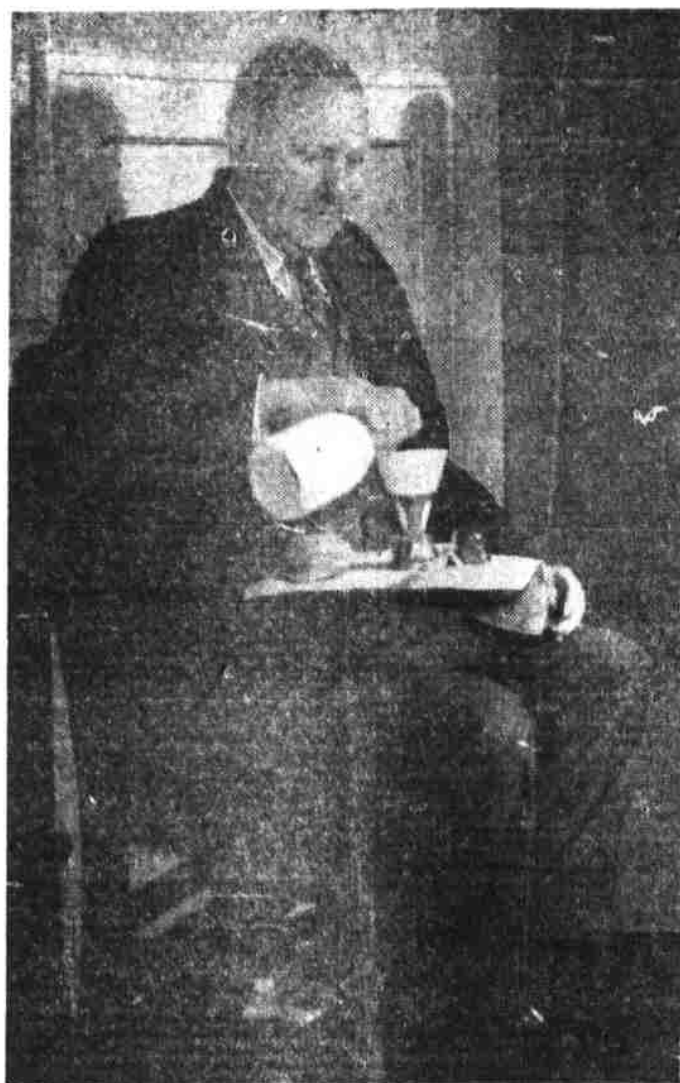
GOVERNOR R. GREGG CHERRY, who has set aside June as Dairy Month, believes in milk as the perfect health food. Here he is shown in an informal pose casually making a good meal of bread and a quart of milk at a Raleigh dairy lunch. "Dairy products are essential to the maintenance of human health and efficiency, both on the fighting front and on the home front," declared Governor Cherry in his proclamation.