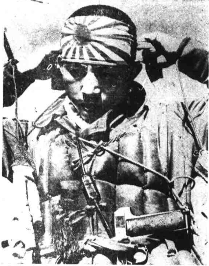
TYPICAL OF JAPAN'S "suicide" combat pilots is this Jap naval aviator, who wears the enemy flag about his head and carries a Samurai sword. Attacking off the shores of Okinawa in large numbers, these zealots were causing considerable damage to American ships before means of checking them were devised.