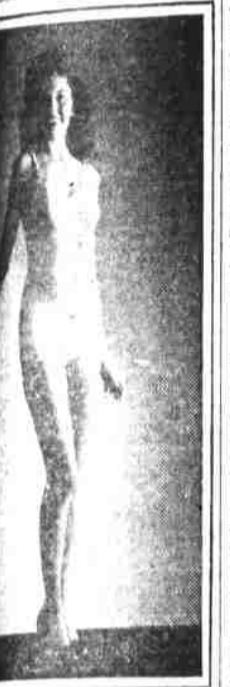
USED TO CALL HER FATTY

Are you tortured with the burning misery of too much free stomach acid? Use of the famous VON TABLETS is bringing comforting relief to hundreds of such cases. Sincerely grateful people tell of what they call the "wonder" Von Tablets have done for them.