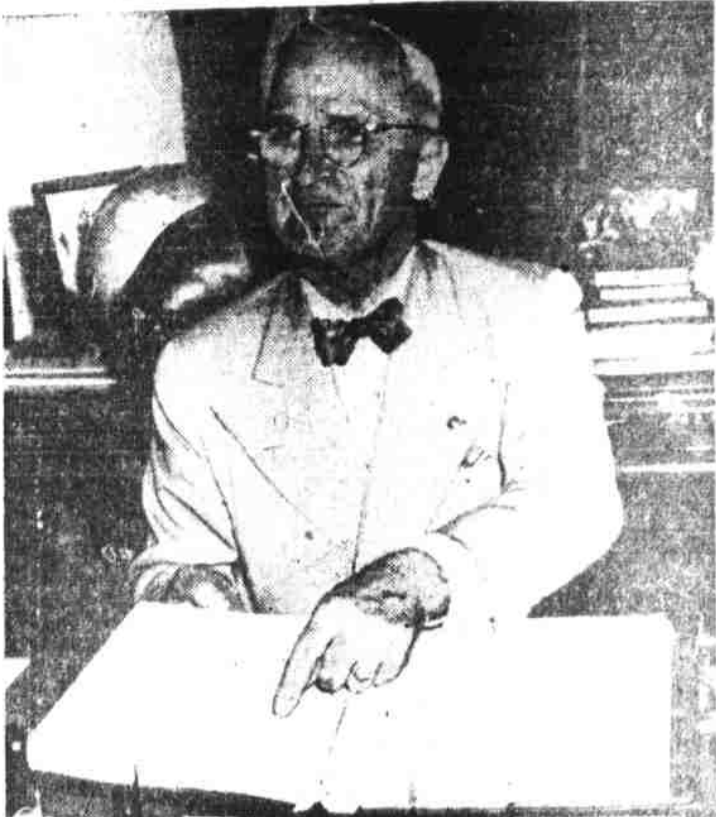
SENATOR ELLIOTT personally asked the Senate to adopt the "Emergency Security Charter," which was done Saturday. He is seen here with the historic document before him.

deficit of 27,000,000 tons of coal next winter.