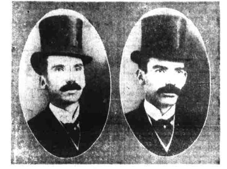
World's Original Twin Auctioneers of Charlotte, N. C.