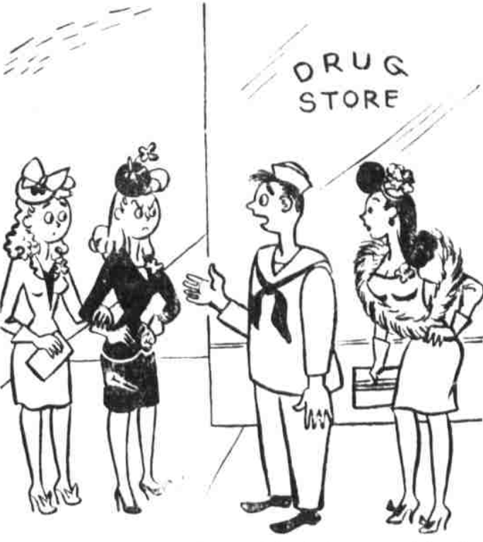
"You said to bring along a friend for your sister!"