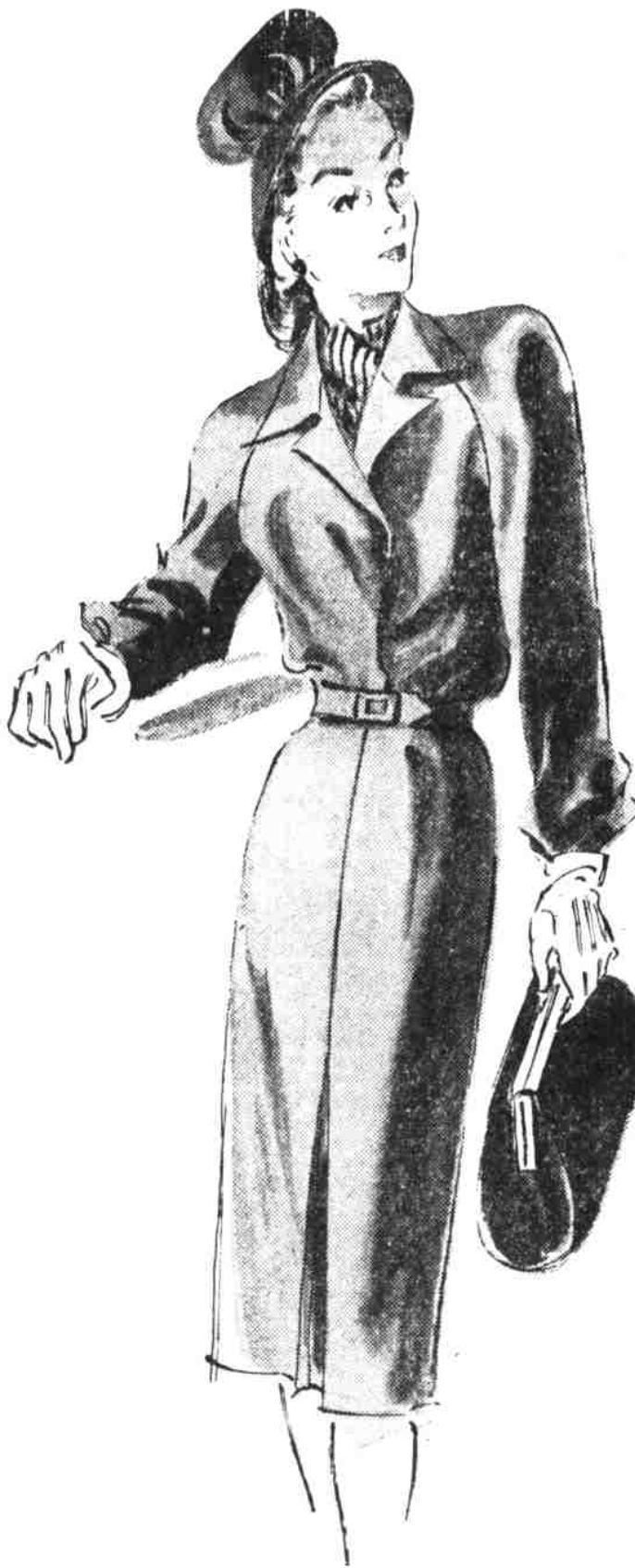
Lumberjack Suit Star— from our new collection

Presenting the smartest, best-looking fashions in the world—for the smartest, best-dressed women in the world! Enter our dramatic, new-season collection for Fall 1945—starring the suits, coats, dresses for this eventful year. Completely American, completely flattering in silhouette; wonderfully wearable, in fabric and tailoring. And featuring the latest flash news in color and fashion detail. Come see the whole group of all-American beauties—at the store that is always first in fashion.