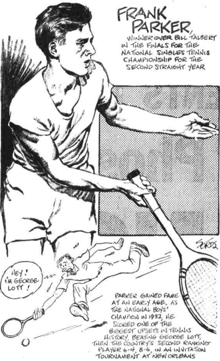
FRANK PARKER WINNER OVER BILL TALBERT IN THE FINALS FOR THE NATIONAL SINGLES TENNIS CHAMPIONSHIP FOR THE SECOND STRAIGHT YEAR

PARKER GAINED FAME AT AN EARLY AGE, AS THE NATIONAL BOYS' CHAMPION IN 1932. HE SCORED ONE OF THE BIGGEST UPSETS IN TENNIS HISTORY, BEATING GEORGE LOTT, THEN THE COUNTRY'S SECOND RANKING PLAYER 6-4, 8-6, IN AN INVITATION TOURNAMENT AT NEW ORLEANS