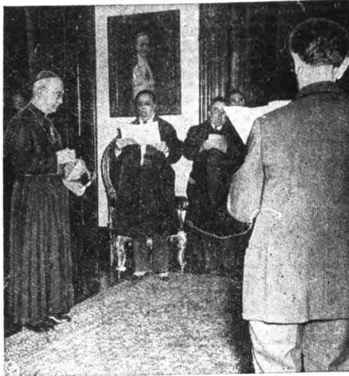
FOLLOWING ANNOUNCEMENT that he would be elevated to the Cardinalate on Feb. 13th, members of the choir of St. Patrick's Cathedral, New York, sing "Behold the Great Priest" as Archbishop Francis J. Spellman bows his head in humble prayer during impromptu ceremonies in throne room of the Archbishop's residence.