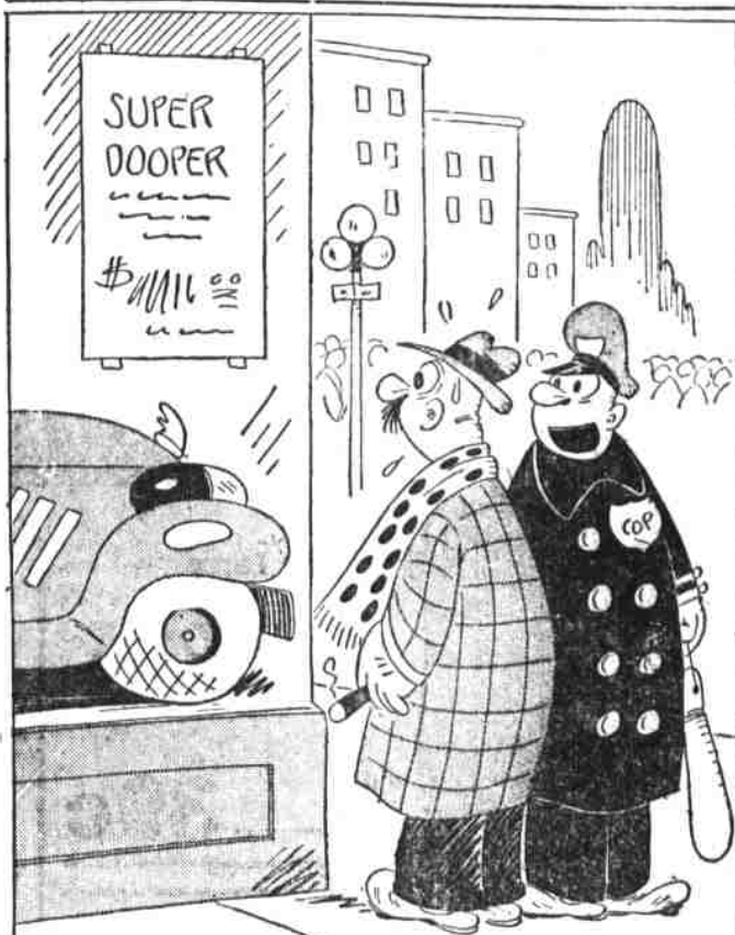
"So your wife is undecided between a sports roadster and a sedan. My advice to you is to build a two-car garage!"