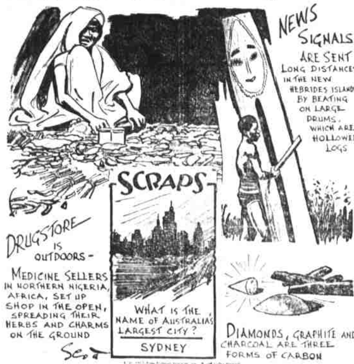
DRUGSTORE IS OUTDOORS - MEDICINE SELLERS IN NORTHERN NIGERIA, AFRICA, SET UP SHOP IN THE OPEN, SPREADING THEIR HERBS AND CHARMS ON THE GROUND. WHAT IS THE NAME OF AUSTRALIA'S LARGEST CITY? SYDNEY. DIAMONDS, GRAPHITE AND CHARCOAL ARE THREE FORMS OF CARBON.