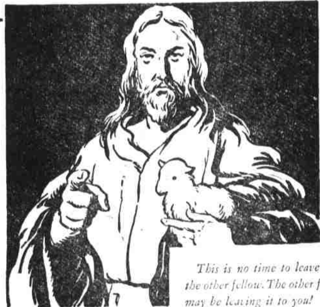
This is no time to leave it to the other fellow. The other fellow may be leaving it to you!

there is a way, and that way the united prayer of Christians. "All things whatsoever thou ask in prayer, believing, ye shall receive." (St. Matt. 21:22). "If ye ask anything in My Name, I will do it." (St. John 14:14). "Verily I say unto you: if ye have faith... nothing shall be impossible unto you." (St. Matt. 17:20).