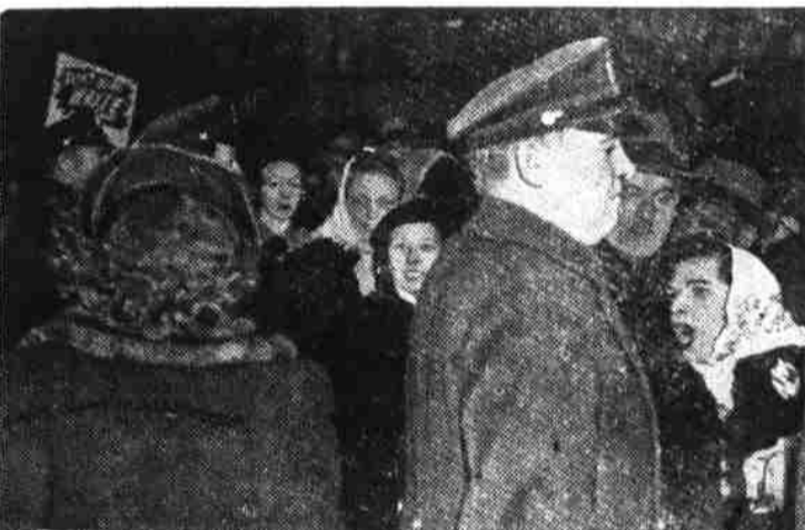
WHILE WOMEN JEER ON THE PICKET LINE, one of a group of 600 Western Electric Co. non-strikers is shown (back to camera) going to work in the New York offices. Union officials agreed to let a number of non-strikers go through the picket lines without interference.