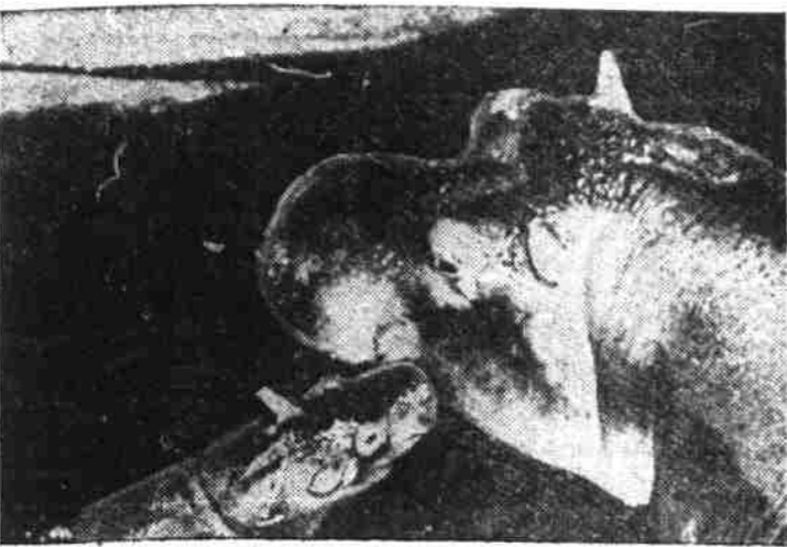
IN THE CHICAGO ZOO it's hip-hippo-hooray for "Bebe's" baby—who arrived two days later than the doctors had expected, but poses here for her first picture. Mama Hippo beams on the little daughter, who appears to be planting a kiss—or maybe just getting acquainted.