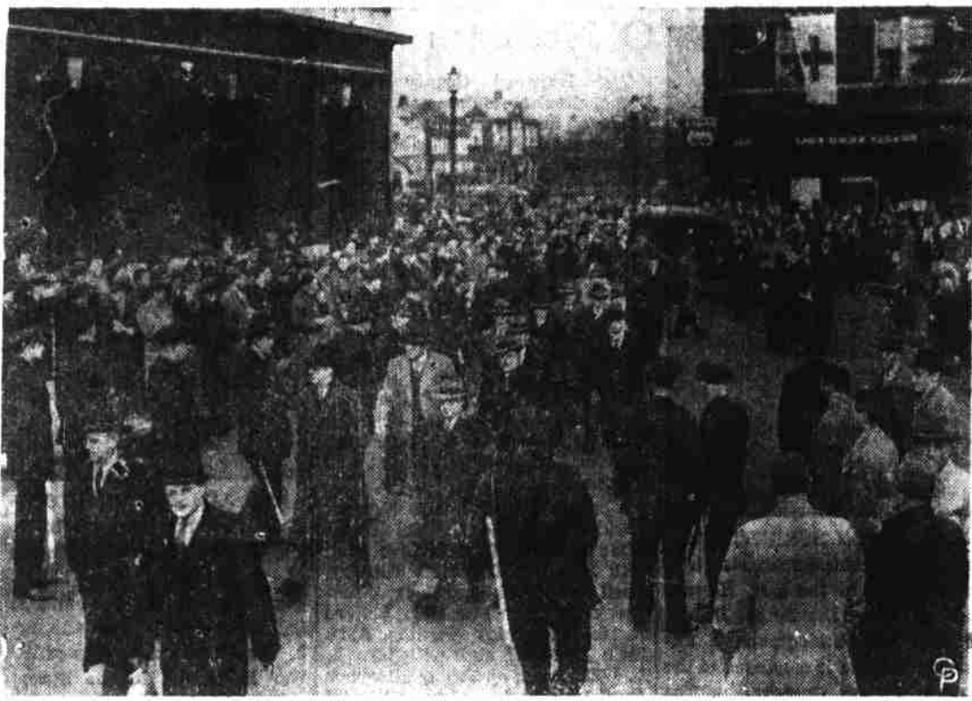
POLICE OF BLOOMFIELD, N. J., are shown keeping picket lines open to the passage of office personnel at the strike-bound Westinghouse Electric plant as striking workers threatened to test the legality of an ancient New Jersey riot act. Union officials attacked the old law as a violation of the Bill of Rights.